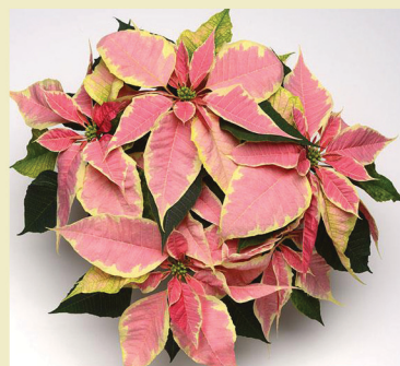
NEW Shade - Marble