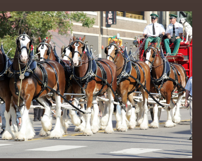
The Museum reaches more than 35,000 each year through face-to-face or online interaction, including new exhibits, tours and programs. About 20 percent of all Museum 'learning encounters' occur outside its walls at special events, speaking engagements and tours.