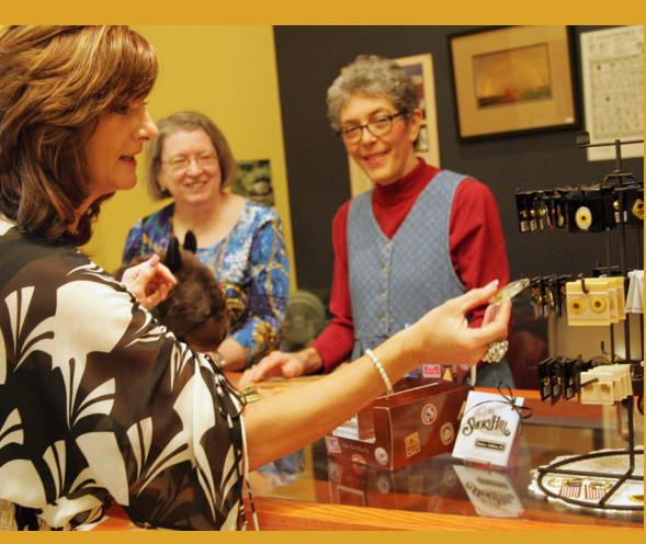
Each year, at least 100 volunteers of all ages donate roughly 2,000 hours. The total 'investment impact' of this volunteer pool is substantial – about $40,000 per year.